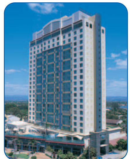
Watermark Hotel, Gold Coast